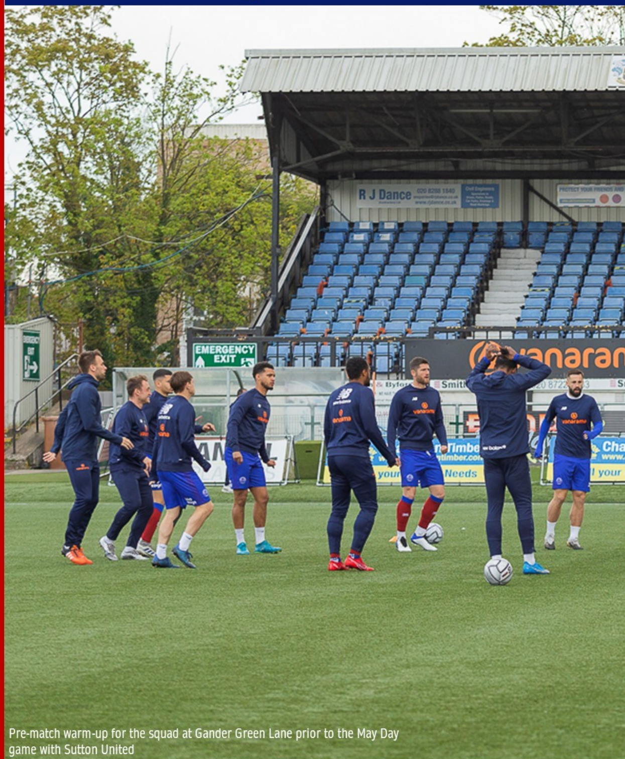
Pre-match warm-up for the squad at Gander Green Lane prior to the May Day game with Sutton United