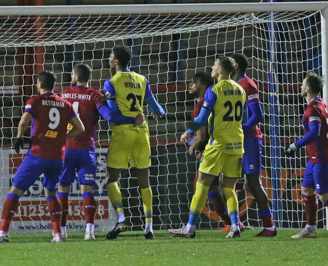
Drama in the Aldershot Town penalty box in Tuesday night's match with Solihull Moors